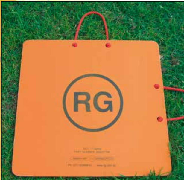
550 x 550 x 16mm