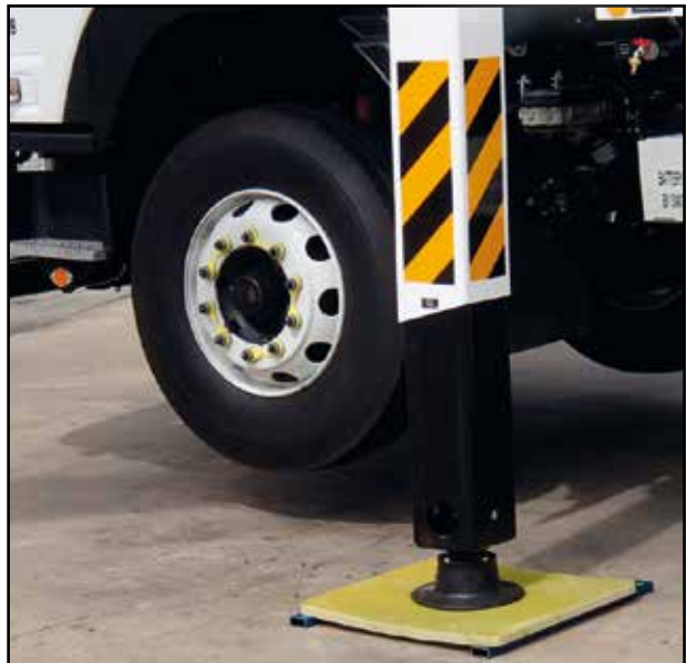
Dunnage supporting full test load of the truck over free span

Dunnage can be supplied in a range of sizes to meet customer requirements. Industry standard sizes are 550 x 550 mm and 300 x 300 mm and can be supplied in a range of colours. Dunnage has been designed to have uniform stiffness and the ability to spread the load evenly across the surface of the ground with improved characteristics in comparison with plastic dunnage. RG dunnage has many advantages over wooden dunnage: