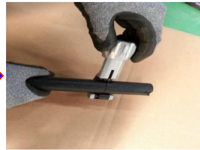
③ Cut the lag of cable