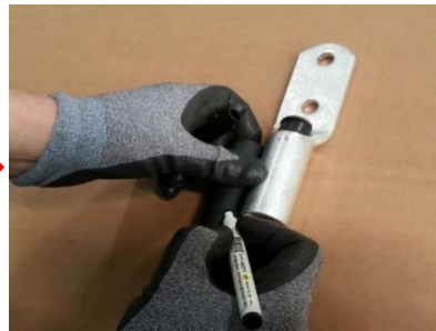
② Mark on cable for removing cable sheath