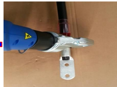
⑥ Clamp on lug