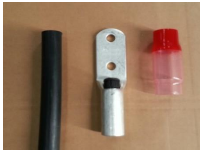
① termination materials (cable, terminal, EyeCap)