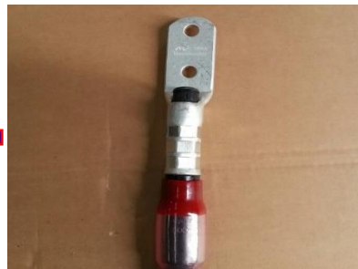
⑦ Clamping completed