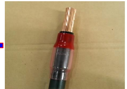
⑤ Slip Cap into Cable