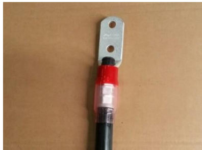
⑧ Slip cap into lug