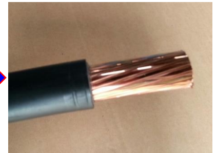
④ Remove the sheath of cable