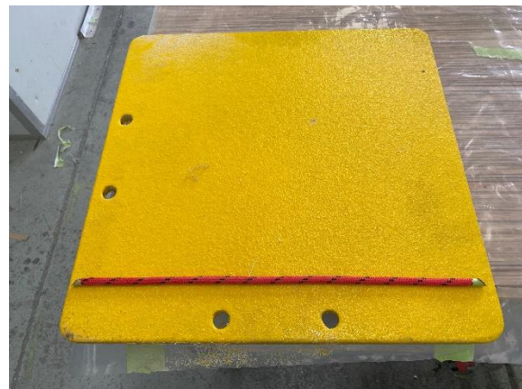
Figure 2 – Cutting lengths for new rope handles