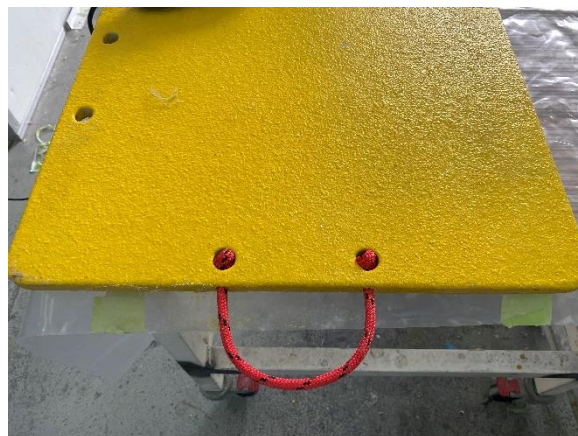
Figure 5 – Completed handle