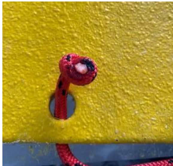
Figure 4 – Sealed rope end