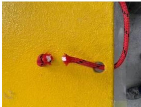
Figure 1 – Removing existing handle